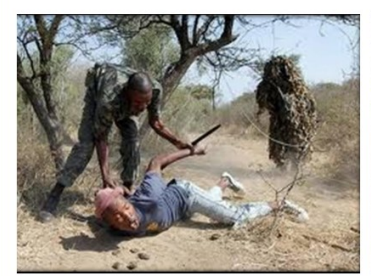
Make the reserve the most undesirable and risky area to poach.