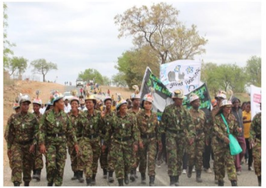
Develop environmentally patriotic community on our borders.

The first all-women ranger unit in Kenya