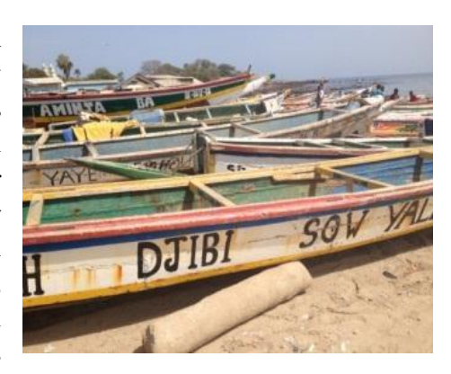
Figure 6: Senegalese pirogues

To avoid these problems, several countries have created Inshore Exclusion Zones, an area along the coast reserved by law for small-scale fishermen, using specific fishing methods and with the aim of conserving fish stocks on which the local communities depend. Well-documented cases exist for several coastal states where the IEZ has been regularly violated by trawlers and the gear of the small-scale fishermen destroyed. In addition, due to the small mesh size of the nets, trawlers catch a very high proportion of juvenile fish which are then discarded. Experts from several coastal states reported significant problems with keeping industrial vessels, especially those trawling for demersal species and shrimp, out