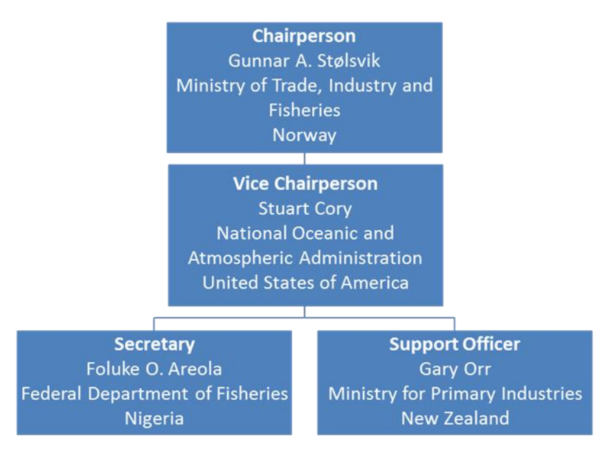
Figure 9: FCWG Board in September 2014

The Board is composed of the following members: