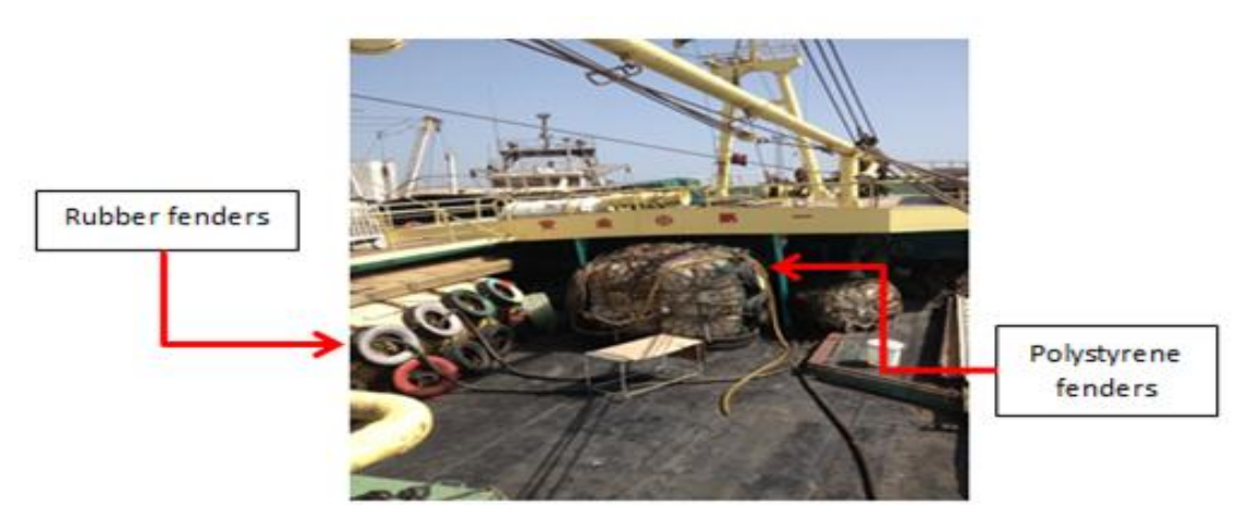
Figure 8: Fenders on board FV Tai Yuan 227, indicative of transhipment activity

The primary evidence for this is the presence of fenders (defence) on the foredeck (see Figure 10 below) which would not normally be on the fishing deck of a longliner. These fenders are to protect vessels from banging against each other whilst transhipping. They also make it easy to transfer crew between vessels.