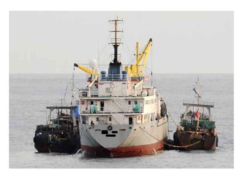
Figure 3: A transhipping operation underway in West African waters between two stern trawlers and a refrigerated fish carrier (reefer). Note the large black fenders (Yokohamas) necessary to prevent the ships from coming into contact with each other. These are carried by the reefer, and their presence on the deck of a reefer indicates that the vessel is likely to engage in transhipping. Black marks on the sides of fishing vessels and reefers are also an indication that fenders have been used and that transhipping may have taken place.

not only represent a fisheries regulatory risk. Out of sight of the authorities, any cargo can be exchanged. Crew members can also easily be moved across vessels, facilitating the occurrence of forced labor at sea. Even when reefer vessels do broadcast vessel tracking information, vessels that come alongside reefers are often not visible to any tracking tools, unlike the reefer whose pattern of behavior in drifting for a few days indicates a risk that undetected and unmonitored vessels have come alongside it. That reefer then has access to secure port facilities and all the logistics of onward supply chains.