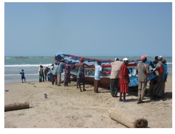
Figure 7: Launch of a new pirogue in the Gambia

Conflicts between the artisanal and industrial sectors have generally decreased in the region, but there is a trend whereby pirogues enter the Exclusive Economic Zones (EEZ) of neighboring countries and then land in their country of origin, demonstrating a transnational aspect of illegality, even within the artisanal sector. There are also accusations that the artisanal sector encroaches into the waters of neighboring countries because it is being pushed out of its own national waters by industrial vessels that infringe and overfish in its IEZ.