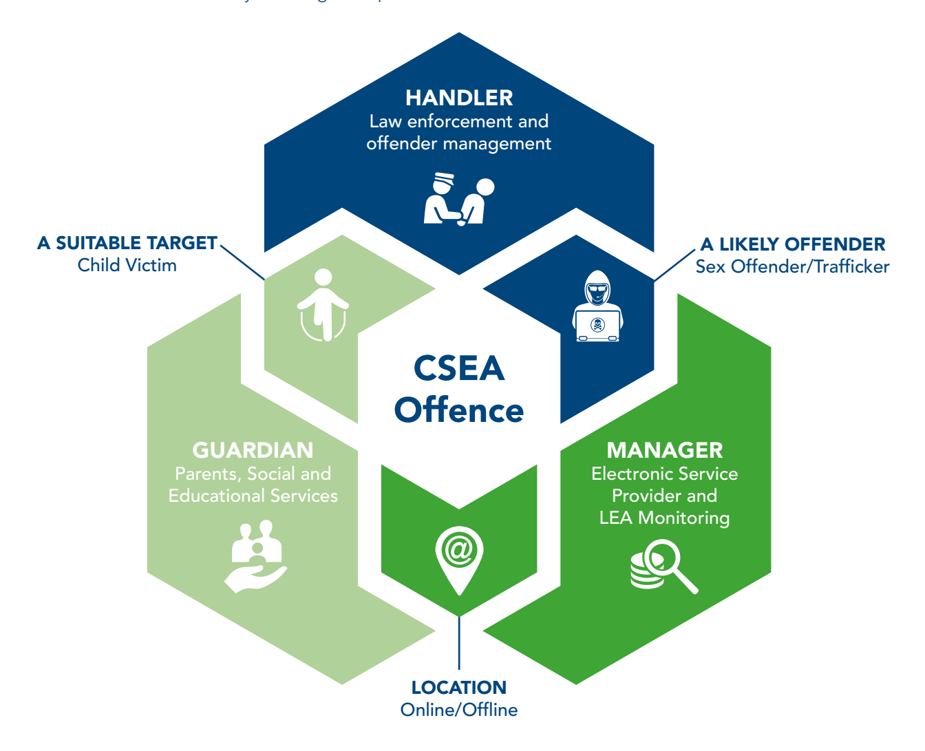
Figure 1: Problem Analysis Triangle in the context of CSEA

In order to understand the impact of COVID-19 on CSEA offences, the use of the Problem Analysis Triangle helps to contextualize the problem. The middle inner layer of the triangle lists the three elements that must be present for a crime to occur and the outer triangle represents the controllers that may intervene on behalf of each element to stop crime from occurring. Figure 1 below is a representation of a Problem Analysis Triangle adapted to the context of online CSEA.