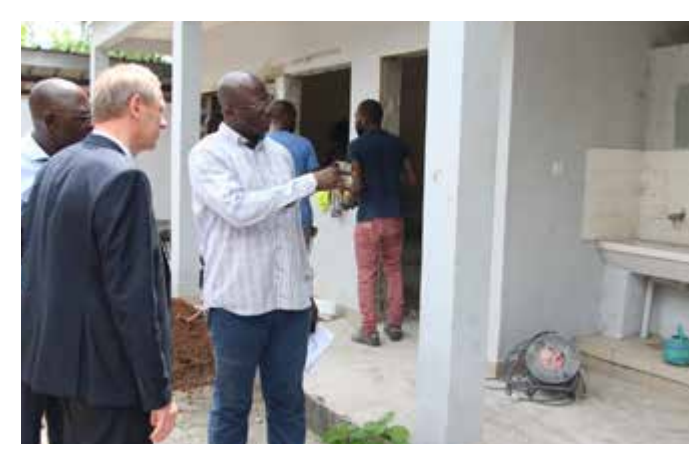
Visit of the sites of the Police data Processing Centre by Director for Development and Planning, 24 February 2020, Abidjan, Côte d'Ivoire

The Police Data Processing Centre in Côte d'Ivoire will act as a data collection and registration centre (DACORE) and will be at the heart of the WAPIS system in Côte d'Ivoire.