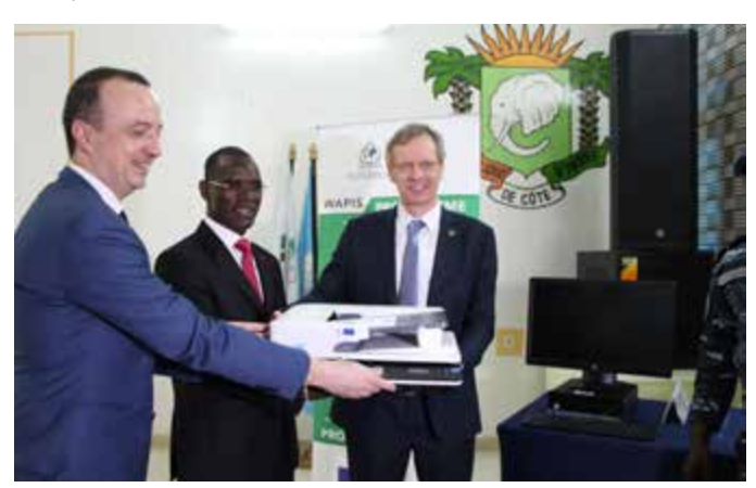
Handover Ceremony of equipment at the Police Academy, 24 February 2020, Abidjan (Côte d'Ivoire)

On 24 February 2020 at the National Police Academy in Abidjan, an official ceremony was held to mark the donation of equipment to the government of Côte d'Ivoire, presided over by the Minister of Security and Civil Defence with participation from INTERPOL's Director for Planning and Development, and representatives of ECOWAS and the European Union.