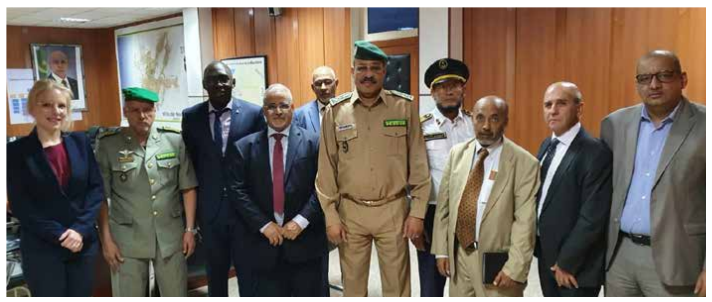
Family photo of the SIPAO National Committee meeting, February 19, 2020, Nouakchott, Mauritania