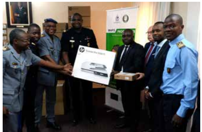
Delivery of IT equipment for the WAPIS system strengthening, Cotonou, June 2018