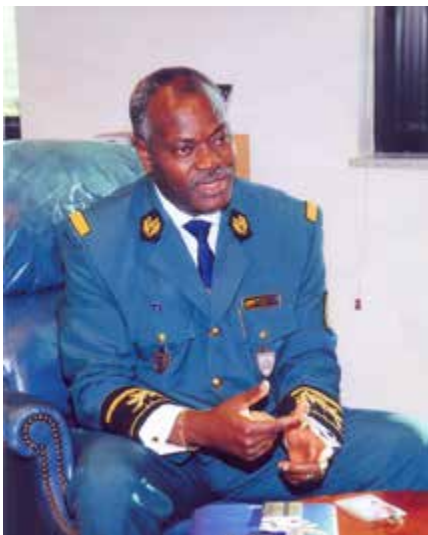
Gen. Francis A. BEHANZIN

Commissioner, Political Affairs, Peace and Security of the ECOWAS