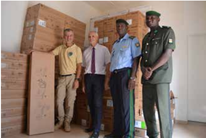
Delivery of IT equipment for the WAPIS system strengthening with EUCAP SAHEL, Niamey, May 2018