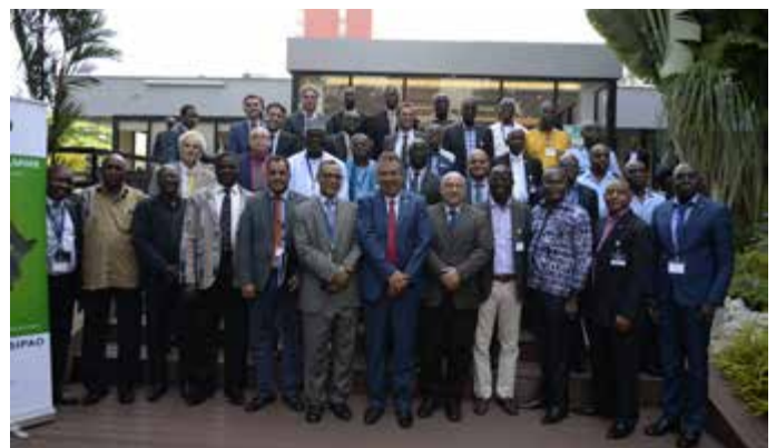
2 nd steering and coordination committee meeting, Abidjan, Côte d'Ivoire, June 2018

To conclude, the European Union, the ECOWAS Commission and INTERPOL exhorted participants to continue the commitments made by the Ministers and Police chiefs in ECOWAS and Mauritania during the launch ceremony in the 3rd phase of the programme.