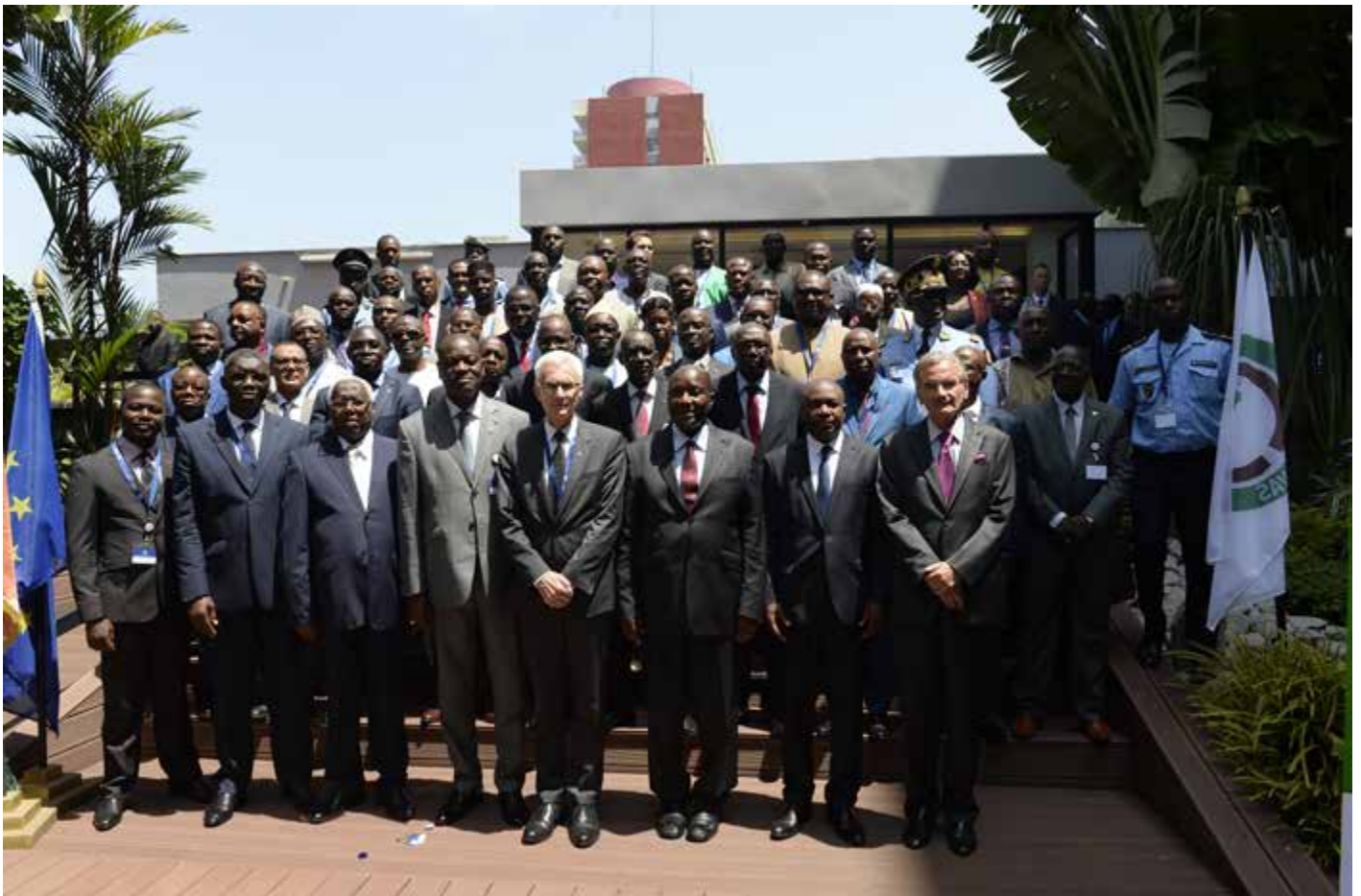
Family picture of the WAPIS 3EDF official Launching ceremony, Abidjan Côte d'Ivoire, June 2018