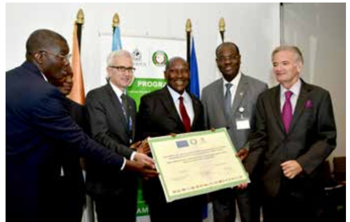
Signature of the WAPIS 3EDF Phase official launching document

the European Union in Côte d'Ivoire, officials responsible for security in West Africa and the diplomatic community in Côte d'Ivoire, this ceremony helped boost the visibility of the WAPIS programme and confirm these leaders' commitment at the highest political level, which is crucial for its implementation in years to come.