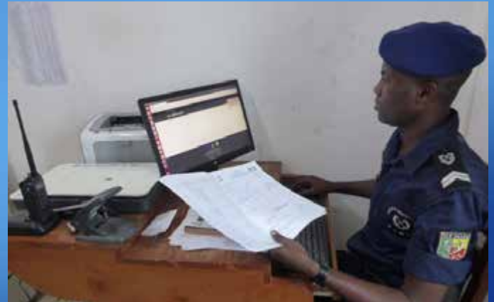
Extension of the WAPIS system at the NCB in Cotonou (September 2016).

For the moment, Benin is an example since it is the only country to have already deployed the WAPIS system on several strategic sites, mainly thanks to the PARSIB precursor project based on the centralization and sharing of police information. With the help of the WAPIS Programme, the local radio circuit was recently installed across the whole of the south of the country, where the two main cities of Cotonou and Porto-Novo are located. The system was also expanded with an extension in the National Central Bureau in Cotonou. The current phase concerns the installation of extensions in the country's third largest city, Parakou, and at the airport in Cotonou.