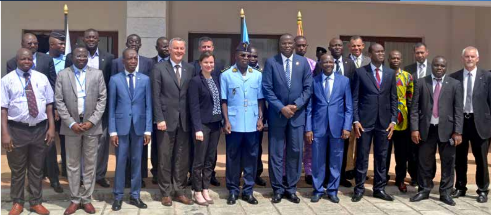
Workshop: Operational launch of the WAPIS Programme in the pilot countries Abidjan, 3-4 May 2016