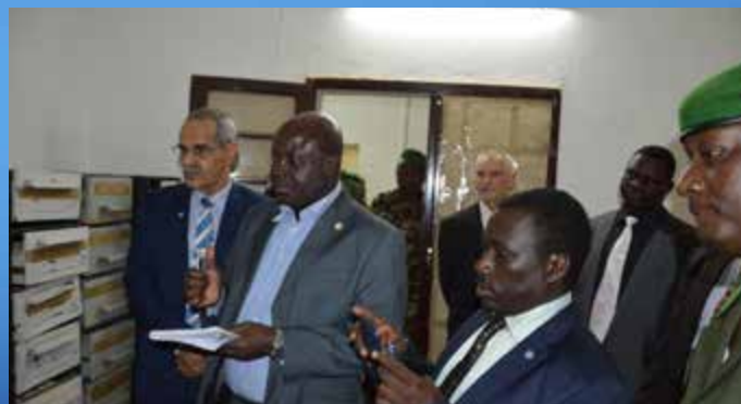
Study mission: Newly appointed SPOCs in the Gendarmerie's national registry in Niamey, 11 October 2016

The Niger authorities have demonstrated outstanding commitment to implementing the WAPIS Programme. In particular, the country has taken the initiative to build a dedicated facility within the Police forensic services compound to host the WAPIS DACORE close to the AFIS system that is currently being installed through European Union funding. Law enforcement authorities have also taken full ownership of the Programme and are engaged in implementing the necessary procedures for police information to be collected and transmitted to the WAPIS DACORE for entering into the WAPIS System.