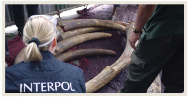
ICCWC WIST in operation in Sri Lanka.

Containers at the Port of Balboa, Panama City.