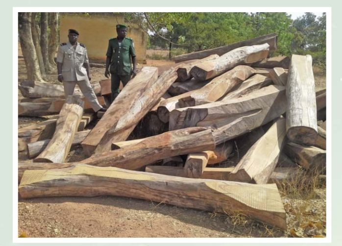
Timber seized in Burkina Faso.

The International Consortium on Combating Wildlife Crime 'ICCWC' is the collaborative effort of five intergovernmental organizations working to bring coordinated support to national wildlife law enforcement agencies and the subregional and regional enforcement networks that act in defence of natural resources.