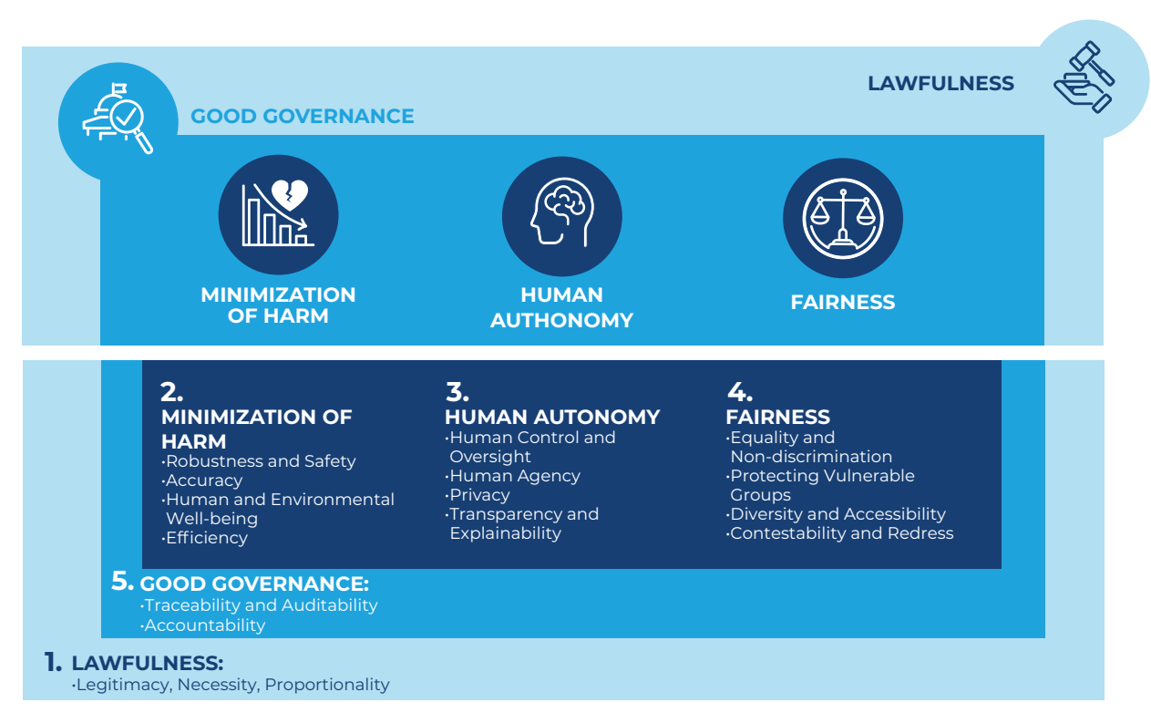
Figure 1 - Core and Instrumental Principles

To realize the five core principles, law enforcement agencies can rely on a set of instrumental principles that complement each of the core principles, as shown in the figure below: