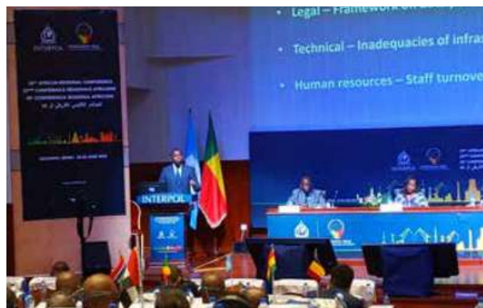
Presentation of the WAPIS Programme during the Conference, Cotonou, Benin, 29 June 2022

The 26 th INTERPOL African Regional Conference will be held in Angola.