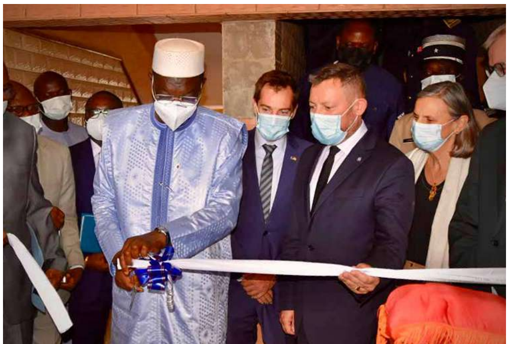
The Minister of Security and Civil Protection cutting the ribbon on the occasion of the inauguration of the CIPT, Lomé, Togo, 29 April 2022

The Lomé CIPT is the 9 th national data centre to be put into operation under WAPIS in West Africa following on from Benin, Burkina Faso, Gambia, Ghana, Mali, Mauritania, Niger and Nigeria.