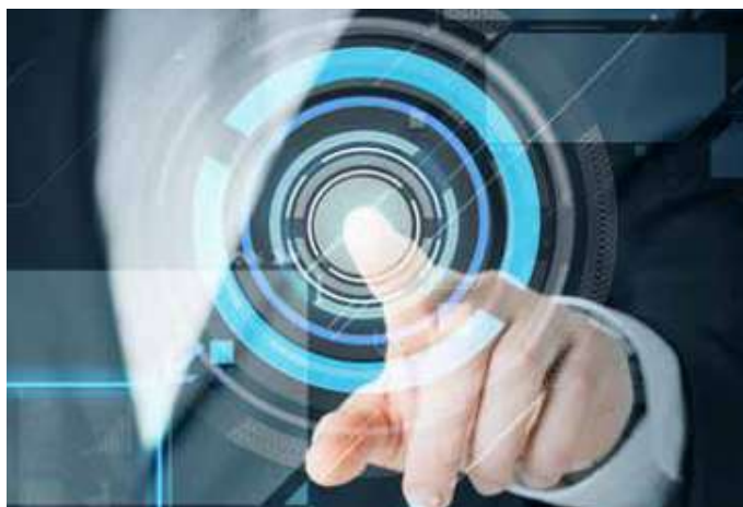
Meeting of the AFIS Project Committee, 21 July 2022

Discussions revolved around the feasibility study conducted by CIVIPOL, recommendations for implementation in each country and the next steps of the AFIS Project. Recommendations were issued at the end of the meeting regarding, in particular, the selection of the three (3) pilot countries for AFIS implementation based on predefined criteria.