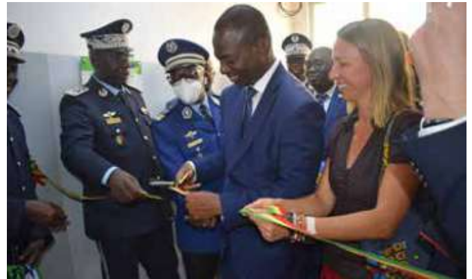
The Head of Cabinet of the Ministry of the Interior cutting the ribbon to mark the inauguration of CREDIPOL, Dakar, Senegal, 17 May 2022

The inauguration ceremony was followed by the first meeting of the WAPIS national committee convened to discuss the action plan for implementing the Programme.