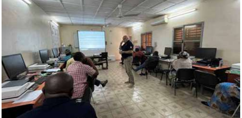
Magistrates following WAPIS training, Niamey, Niger, 24 February 2022

Parallel meetings were held with the UNDP with a view to boosting synergy with other programmes and international organizations. The UNDP is keen to support an extension of