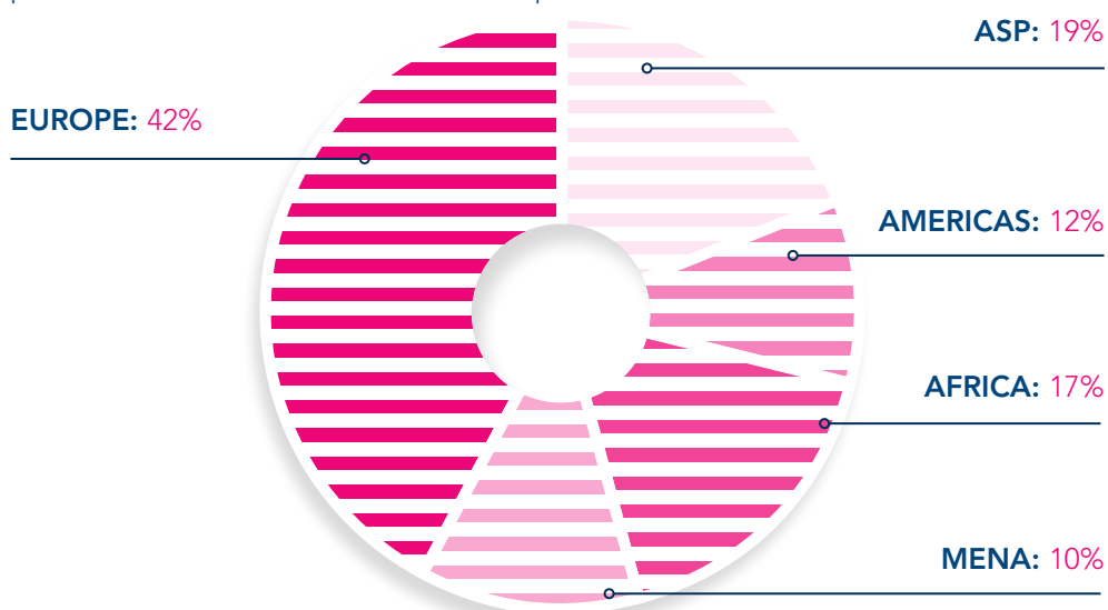
Fig 1. INTERPOL Global Cybercrime Surveys: Breakdown of the Respondents By Region

In light of these events, INTERPOL's Cybercrime Directorate produced this Global Assessment Report on COVID-19 related Cybercrime based on its unique access to data from 194 member countries and private partners to provide a comprehensive overview of the cybercrime landscape amid the pandemic. The report is based on data collected from member countries and INTERPOL private partners as part of the INTERPOL Global Cybercrime Survey conducted from April to May 2020. In total, 48 out of 194 member countries responded to the Survey and 4 out of 13 private partners contributed their data to the report.