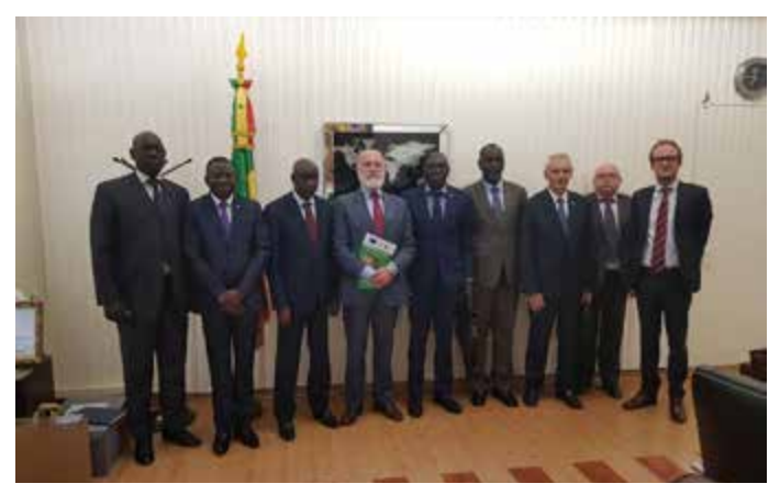
Meeting between the Interpol-UE delegation with the Senegalese Minister of Interior, 23 February 2018

In fact, on February 23rd 2018, the delegation had a meeting with the Minister of Interior, Mr Aly Ndiaye, whom expressed the firm commitment of the government of Senegal to collaborate for the success of this Programme in the country.