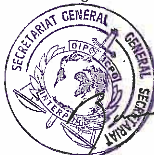
Ronald K. Noble Secretary General

For the International Criminal Police Organization - Interpol