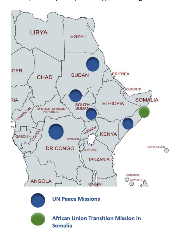
FIGURE 2 PEACE MISSIONS IN EASTERN AFRICA.

Moreover, there is a high international presence in the region supporting countries with peacekeeping and peacebuilding operations as it is illustrated in Figure 2<sup>22</sup>. Since 2015, the United Nations Police Division within the Department of Peacekeeping Operations (DPKO) has been tasked with providing technical expertise and assistance to national police and law enforcement institutions in post-conflict settings to prevent, disrupt and dismantle organized criminal activities, including drug trafficking, human trafficking, firearms trafficking and exploitation of natural resources<sup>23</sup>. This incorporation of a serious and organized crime component in post-conflict settings evidences the United Nations concerns on challenges that serious and organized crime pose to peace, security, human rights and development.