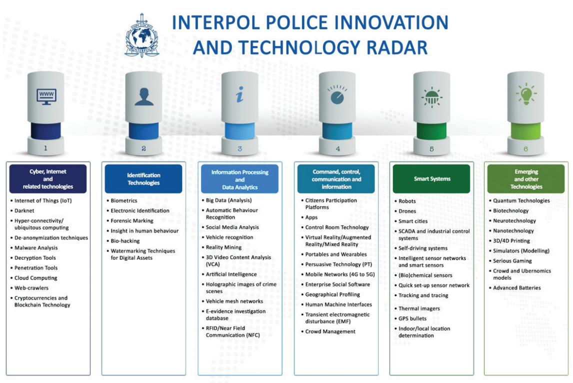
This graphic is an overview of emerging technologies in support of horizon scanning for law enforcement which requires constant updates

In terms of 'Horizon Scanning' for the future of policing landscape and activities affected by emerging technologies, the Radar is a constant work-in-progress for Innovation Centre of INTERPOL and its partners. The Radar aims to ensure that policing agencies are always capable to keep up, if not become the front-runner in recognizing, addressing, and innovating the latest technologies into operative measures.