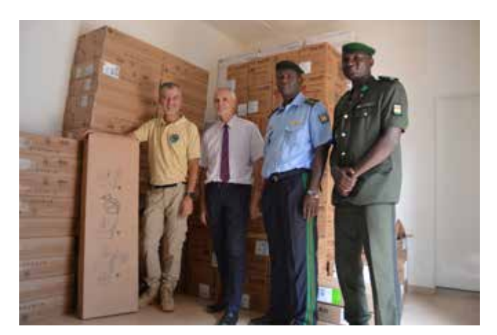
Delivery of IT equipment for the WAPIS system strengthening with EUCAP SAHEL, Niamey, May 2018 \,