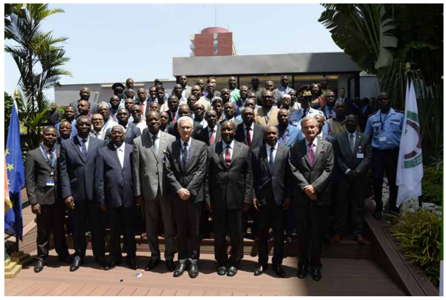
Family picture of the WAPIS 3EDF official Launching ceremony, Abidjan Côte d'Ivoire, June 2018