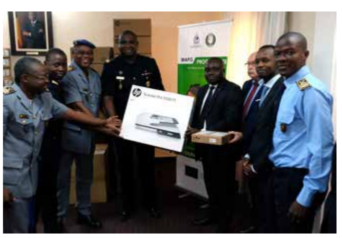
Delivery of IT equipment for the WAPIS system strengthening, Cotonou, June 2018