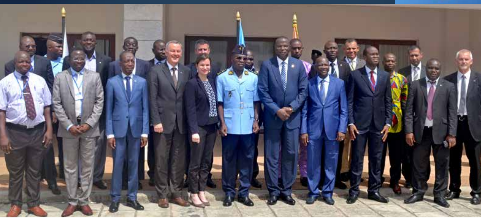
Workshop: Operational launch of the WAPIS Programme in the pilot countries Abidjan, 3-4 May 2016