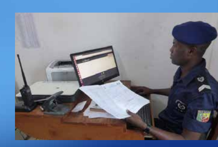
Extension of the WAPIS system at the NCB in Cotonou (September 2016).

equipment (CPE) and antennas (pylons) for the base stations. All these elements will form a local radio circuit, which will allow several administrative buildings to be connected within a radius of about 20 km.