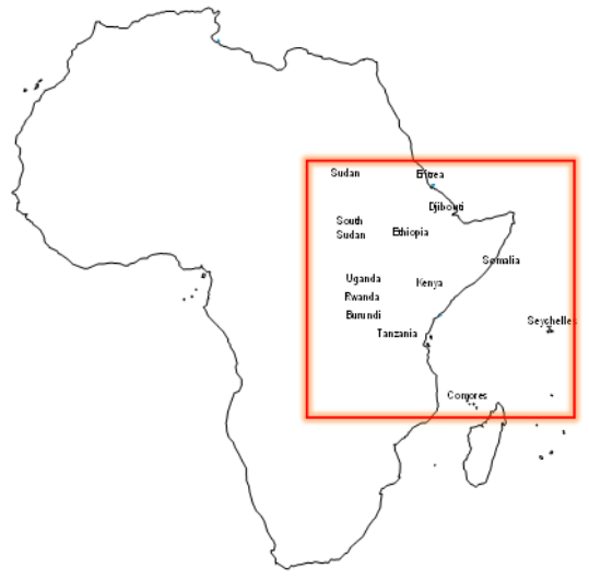
Figure 1 Eastern Africa Region

The report focuses on the following countries: the Republic of Burundi, the Union of the Comoros, the Republic of Djibouti, the State of Eritrea, the Federal Democratic Republic of Ethiopia, the Republic of Kenya, the Republic of