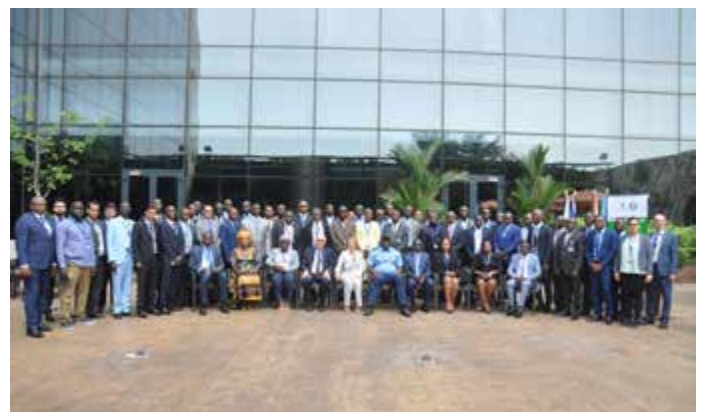
ECOWAS Expert Committee opening ceremony, Abidjan (Côte d'Ivoire), 27 March 2018

The conclusions of this meeting will be shared and discussed in the next WAPIS newsletter.