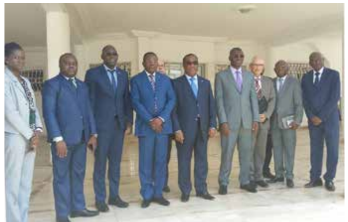
Strategic visit in Togo, meeting with the Prime Minister of Togo, 27 February 2018.