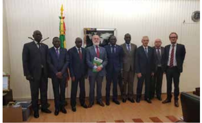
Meeting between the Interpol-UE delegation with the Senegalese Minister of Interior, 23 February 2018

In fact, on February 23rd 2018, the delegation had a meeting with the Minister of Interior, Mr Aly Ndiaye, whom expressed the firm commitment of the government of Senegal to collaborate for the success of this Programme in the country.