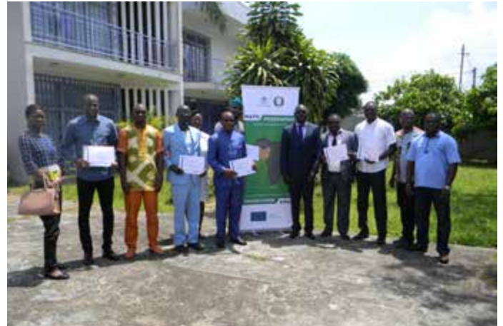
WAPIS IT Administrators training in Abidjan, (Côte d'Ivoire) 16 March 2018

These training sessions strengthened the will to guarantee a sustainability of the system once the partners will retire at the end of the implementation period. More trainings