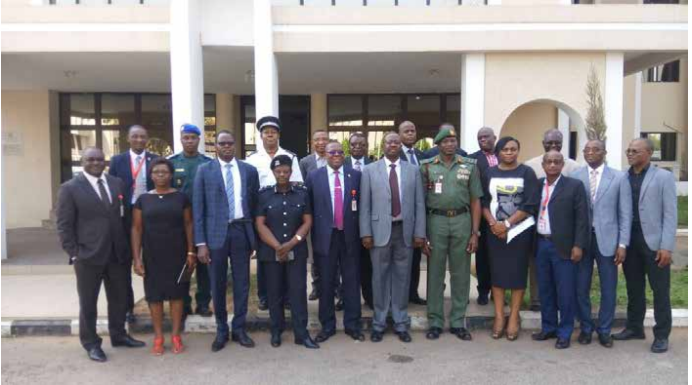
ECOWAS meeting with the SADC, EASF with the participation of WAPIS, Abuja (Nigeria), 19 February 2018