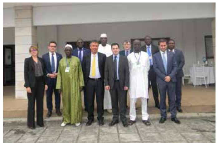
First Steering Committee, Abidjan, Côte d'Ivoire, February 2018

The ECOWAS Commission and the EU unanimously reaffirmed the importance of WAPIS and expressed their strong commitment to implement it. The Steering Committee