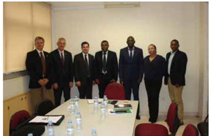
Strategic Visit in Cape Verde, Meeting with the Director of the judicial police, 8 February 2018

Unanimously, the officials showed strong interest in the implementation of WAPIS and reassured the delegation of their entire availability to support the process. Following this strategic visit, a technical audit mission will take place