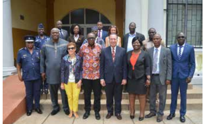
Meeting on the WAPIS implementation in Ghana with the Minister of Interior, the European Union Ambassador in Ghana and the INTERPOL Executive Director for Planning, 2 October 2018