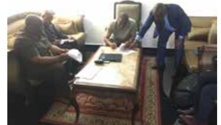
Signature of the Memorandum of Understanding between INTERPOL and Liberia by the Minister of Justice and Internal Affairs, Monrovia, 24 October 2018

The WAPIS Programme team is continuing to work towards formalizing a Memorandum of Understanding with other countries. Further official signatures are expected in the coming months.