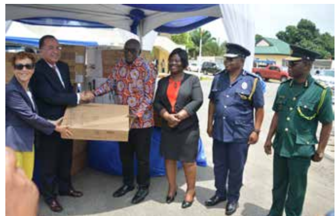
Official handover ceremony for the WAPIS Extension. From Left to right: European Union Ambassador in Ghana, the INTERPOL Executive Director for Partnerships and Planning and the Minister of Interior