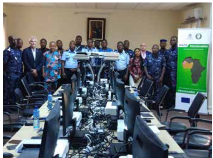
Law enforcement agents training on WAPIS, Cotonou, 12-16 Novembre 2018

In COTONOU, Benin, WAPIS Programme experts conducted a training with 20 officers about using WAPIS. In Benin, the Programme will be expanded to other sites in the capital and throughout the country.