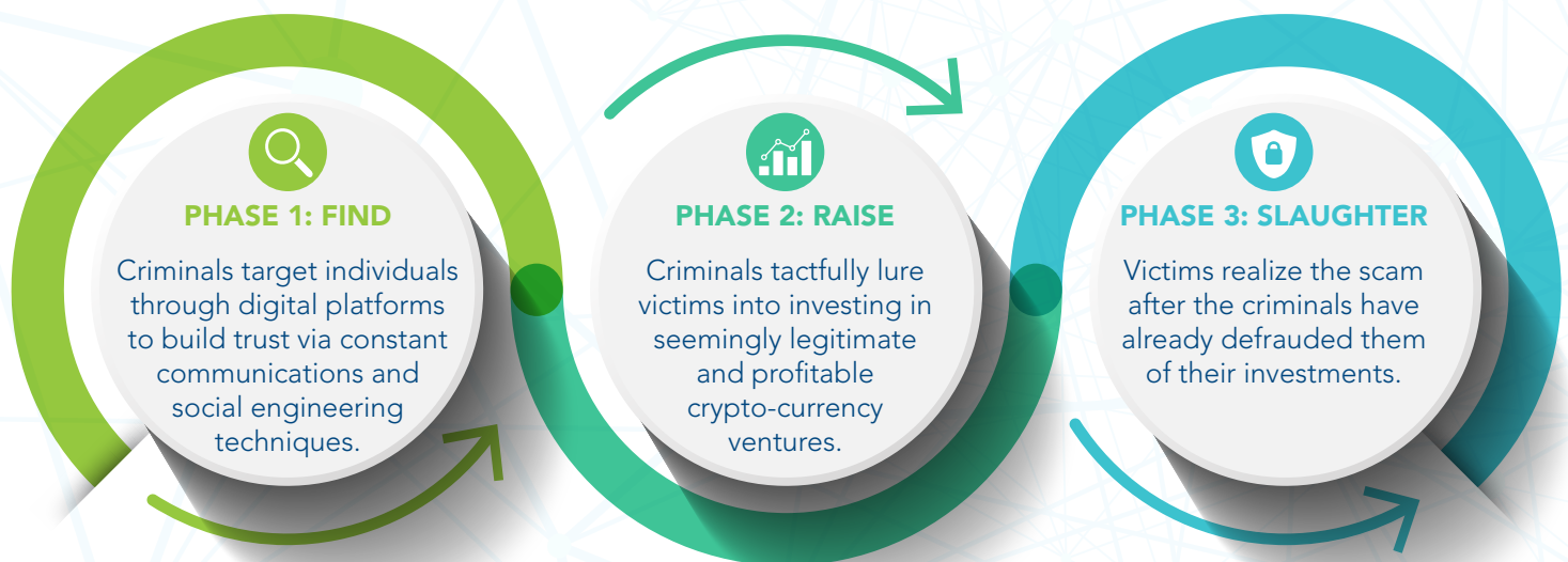
The phases of the “Pig butchering” 13

media platforms such as Facebook and Instagram, messaging services such as SMS, WhatsApp, Telegram, and Signal, or dating apps. They may claim to have received the victim’s contact details through a referral or a mutual friend. To better lure their targets in, criminals often use a fake account, impersonating an attractive person with photos stolen from other individuals or generated using AI, in a modus operandi similar to that of romance scams. In the next step, they “fatten up” the victim by gaining their trust and gradually portraying themselves as investment experts. The criminals’ tactic is to bait victims into investing in seemingly legitimate and profitable cryptocurrency ventures. However, as soon as the victim has transferred substantial amounts, or they begin to realize they are being scammed, the criminals cash out and disappear. To make tracing and recovering assets as difficult as possible, criminals typically seek to convert their victims’ funds using digital payments or cryptocurrency platforms. During this final step, sometimes known as “slaughtering”, perpetrators stop responding to messages or calls from the victim, which leads to financial and emotional harm.