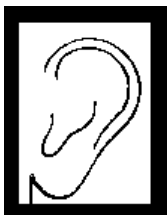
1 Not attached