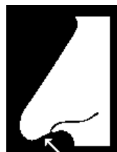
4 Turned down