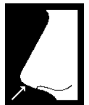
6 Turned up