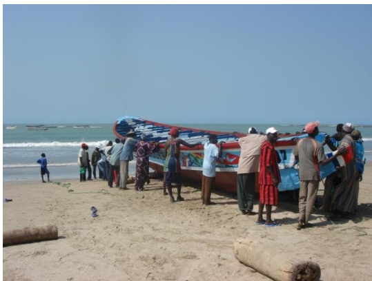
Figure 7: Launch of a new pirogue in the Gambia

Conflicts between the artisanal and industrial sectors have generally decreased in the region, but there is a trend whereby pirogues enter the Exclusive Economic Zones (EEZ) of neighboring countries and then land in their country of origin, demonstrating a transnational aspect of illegality, even within the artisanal sector. There are also accusations that the artisanal sector encroaches into the waters of neighboring countries because it is being pushed out of its own national waters by industrial vessels that infringe and overfish in its IEZ.