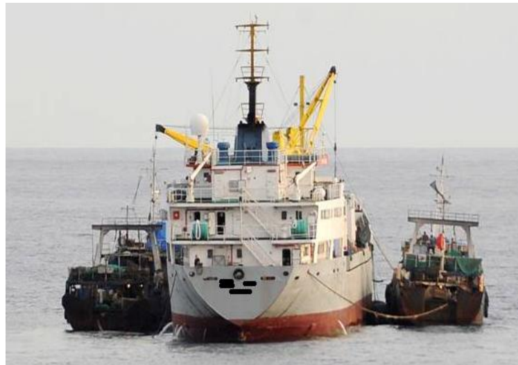
Figure 3: A transshipping operation underway in West African waters between two stern trawlers and a refrigerated fish carrier (reefer). Note the large black fenders (Yokohamas) necessary to prevent the ships from coming into contact with each other. These are carried by the reefer, and their presence on the deck of a reefer indicates that the vessel is likely to engage in transshipping. Black marks on the sides of fishing vessels and reefers are also an indication that fenders have been used and that transshipping may have taken place.

not only represent a fisheries regulatory risk. Out of sight of the authorities, any cargo can be exchanged. Crew members can also easily be moved across vessels, facilitating the occurrence of forced labor at sea. Even when reefer vessels do broadcast vessel tracking information, vessels that come alongside reefers are often not visible to any tracking tools, unlike the reefer whose pattern of behavior in drifting for a few days indicates a risk that undetected and unmonitored vessels have come alongside it. That reefer then has access to secure port facilities and all the logistics of onward supply chains.