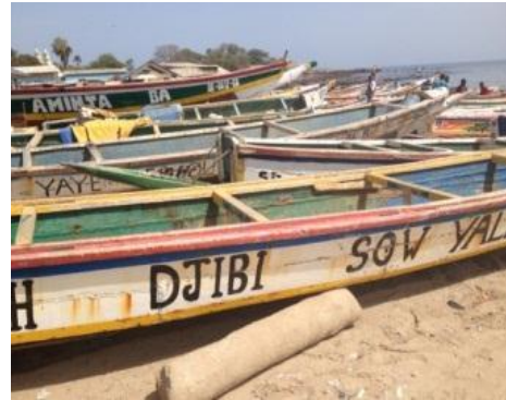
Figure 6: Senegalese pirogues

Conflicts between the artisanal and industrial sectors have generally decreased in the region, but there is a trend whereby pirogues enter the Exclusive Economic Zones (EEZ) of neighboring countries and then land in their country of origin, demonstrating a transnational aspect of illegality, even within the artisanal sector. There are also accusations that the artisanal sector encroaches into the waters of neighboring countries because it is being pushed out of its own national waters by industrial vessels that infringe and overfish in its IEZ.